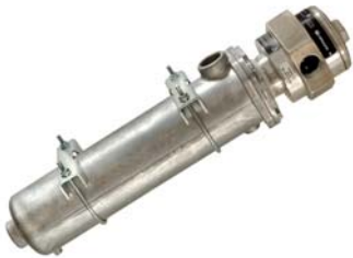
EE Model without thermostat