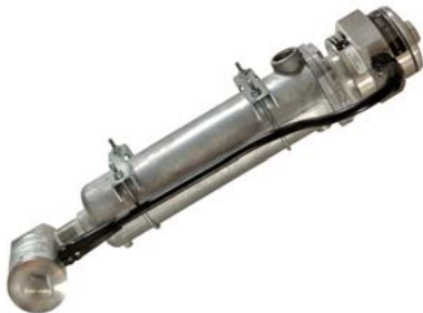
EE Model assembled with thermostat